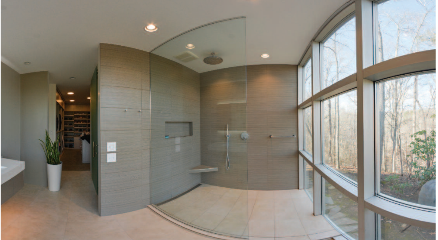
North Carolina Construction News special feature

Clearlight Glass & Mirror was founded in 1994 by a glass artisan with intimate knowledge of glass machinery. Beginning with the finest Italian machines to fabricate glass, the company continues to provide high-quality custom glass products, from unique OEM solutions to specially-measured and designed frameless showers.